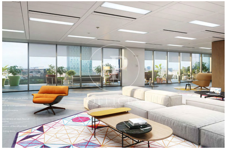
La terraza en cada planta es de propiedad de la propia empresa y está acondicionada para ser utilizada como sala de reuniones o sala de espera.