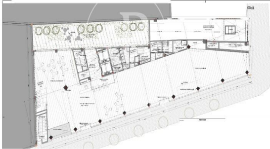
PLANTA BAJA 489,08 m²