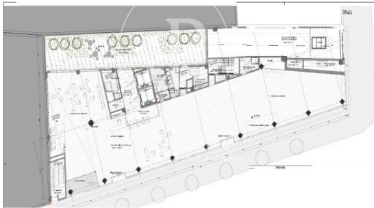
PLANTA TIPO 300 - 700 m 2