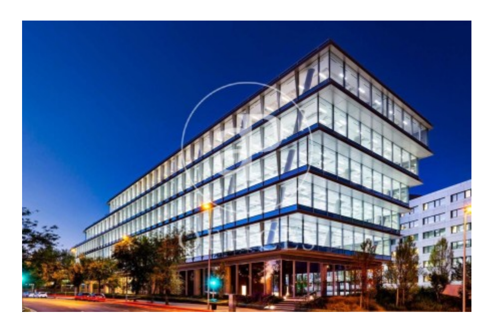
Price from 24,735 € | Surface 970 m² - 1946 m² | 9 Units

OFFICE IN REPRESENTATIVE AND EXCLUSIVE OFFICES BUILDING NEAR CIUDAD BBVA. Port of Somport 21-23. Madrid inspiring new talent. An inspiring symbiosis between life and business in one of the axes of Madrid Nuevo Norte. A new hub of 60,000 m² (sqm) that combines offices, premium services and restaurants designed by KPF and B.O.D. and that will be developed in phases. The project has been designed to achieve the prestigious LEED® Platinum certification. Surrounded by all kinds of services and very well connected by both public and private transport; Atocha Station is a 17-minute drive away and is 9 minutes from Adolfo Suarez Airport. Can you imagine working here?