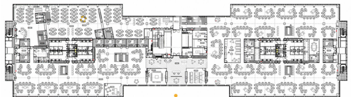
Planta CUARTA AMUEBLADA