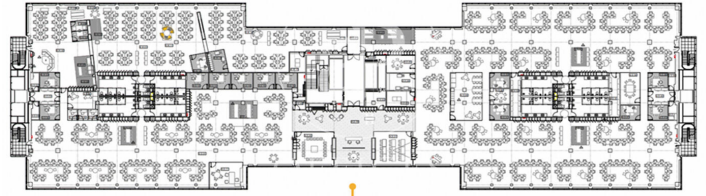
Planta CUARTA AMUEBLADA